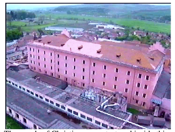
Thousands of Christians were tortured inside this Communist prison of Gherla, Romania