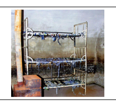
Prison cell with bunk-beds with no mattress, prisoners were obliged to sleep on. Stove for show only, never heated in cold winters.