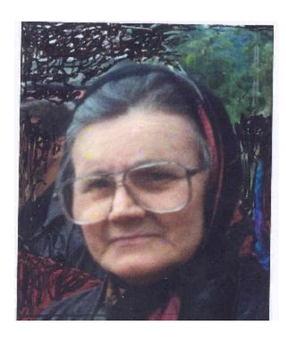
A Christian Testimony