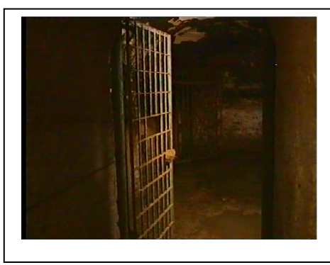
Totally dark Jilava cell where many Christians were held prisoners