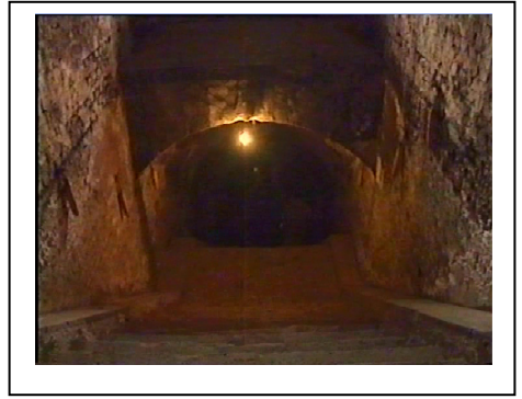
The Communist Jilava Prison. Entrance to the underground cells.