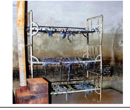
Prison cell with bunk-beds with n mattress, prisoners were obliged to sleep on. Stove for show only, never heated in cold winters.