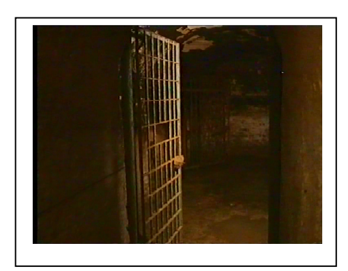
Totally dark Jilava cell where many Christians were held prisoners