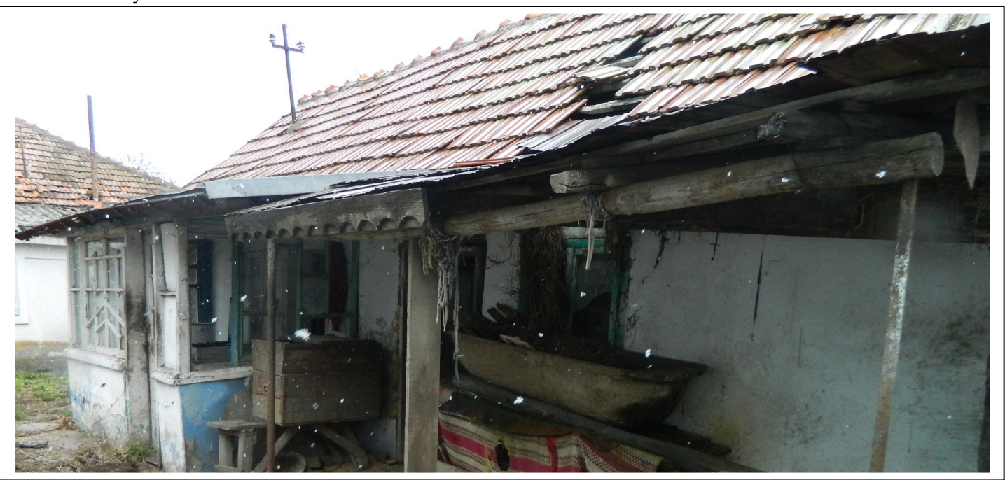
The Wretched Shack From Which The Nemtanu Children Were Rescued