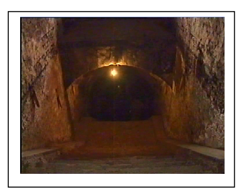
The Romanian Communist Jilava Prison: Entrance to the underground cells

Becoming one is not just coming together in worship, in agreement and with the feel "I am ok, you are ok." In the history of the church, often one Christian arose, someone considered insignificant yet this person made the difference by kindling again the Lord's glowing fire He brought on earth, of love for our fellow Christians.