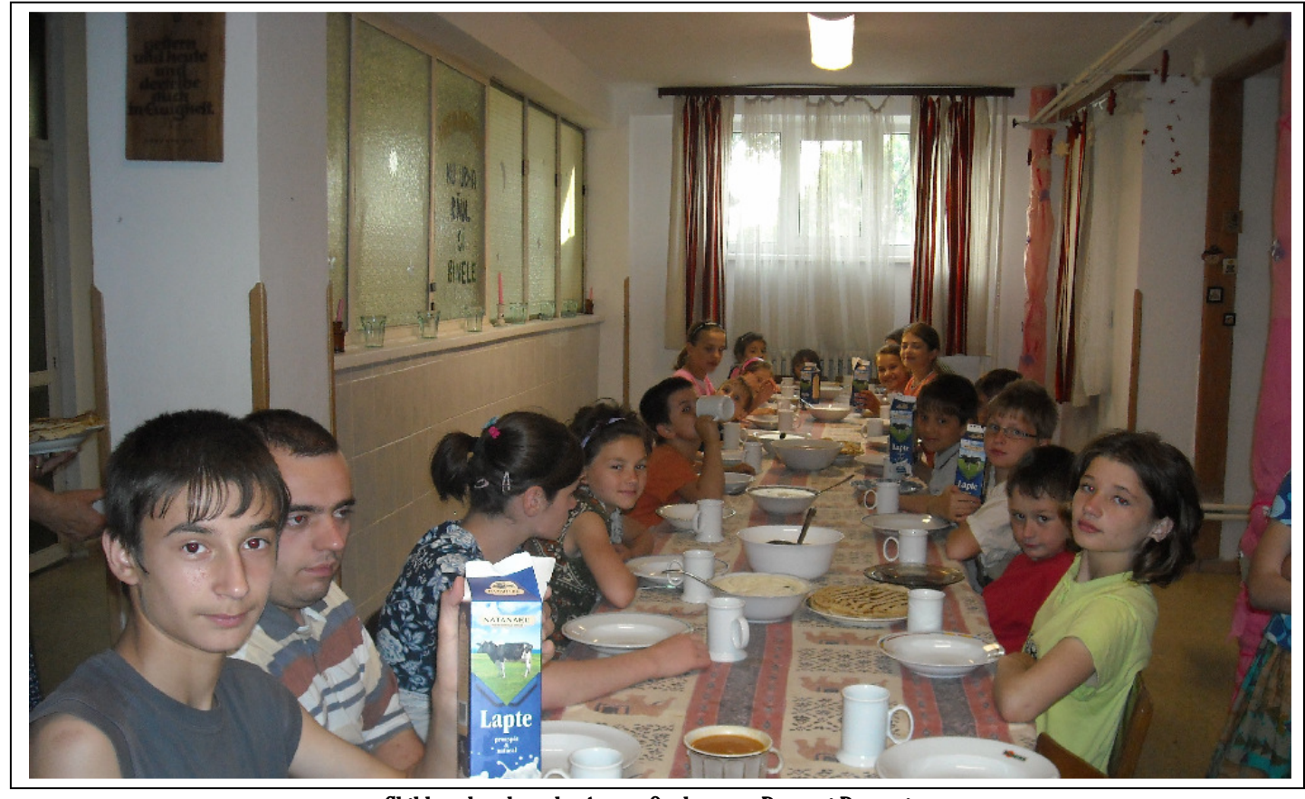
Children lunch at the Agape Orphanage, Pascani Romania

Email: <a href="mailto:helpforrefugees@verizon.net">helpforrefugees@verizon.net</a>; Internet Address: <a href="http://helpforrefugees.com">http://helpforrefugees.com</a>