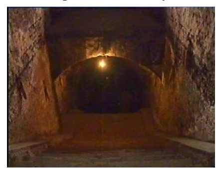
The Communist Jilava Prison. Entrance to the underground cells.