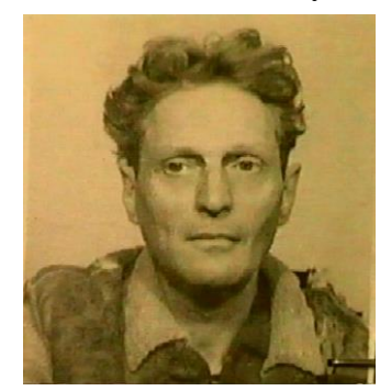
Wurmbrand when held in Jilava.