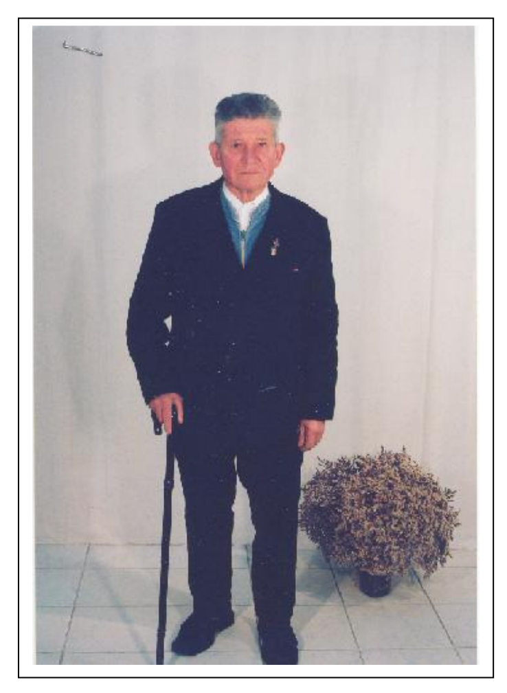
family home was seized.