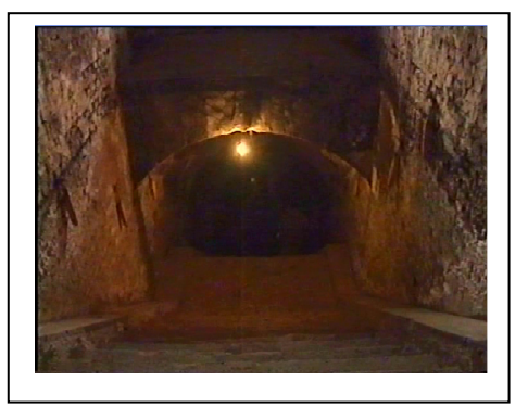
The Communist Jilava Prison. Entrance to the underground cells.

God says : "ye are the salt of the earth" and even more than that: "YE ARE THE LIGHT OF THE WORLD!"