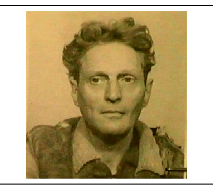
Wurmbrand when held in Jilava.

Help For Refugees (EIN: 95-3064521) is listed in Publication 78, Cumulative List of Organizations described in Section 170(c) of the Internal Revenue Code of 1986, a list of organizations eligible tax-deductible charitable contributions. receive May be checked online at: to http://www.irs.gov/app/pub-78/