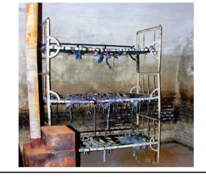
Prison cell with bunk-beds with no mattress, prisoners were obliged to sleep on. Stove for show only, never heated in cold winters.